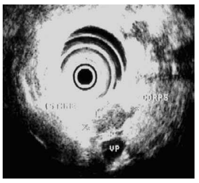
Figure I Preoperative localization of the tumour with Endoscopic Ultrasonograhy. Endoscopic Ultrasonography performed with a mechanical sector scanner (Olympus GF-UM 20, Hamburg, Germany) showed hypoechogenic tumour of 10 × 20 mm in diameter, located between the isthmus and the body of the pancreas with no signs of vascular invasion or proximal pancreatic canal distension.

An endoscopic ultrasonography was performed with a mechanical sector scanner (Olympus ^{*} GF-UM 20, Hamburg, Germany), which detected a 20 × 10 mm hypoecho-