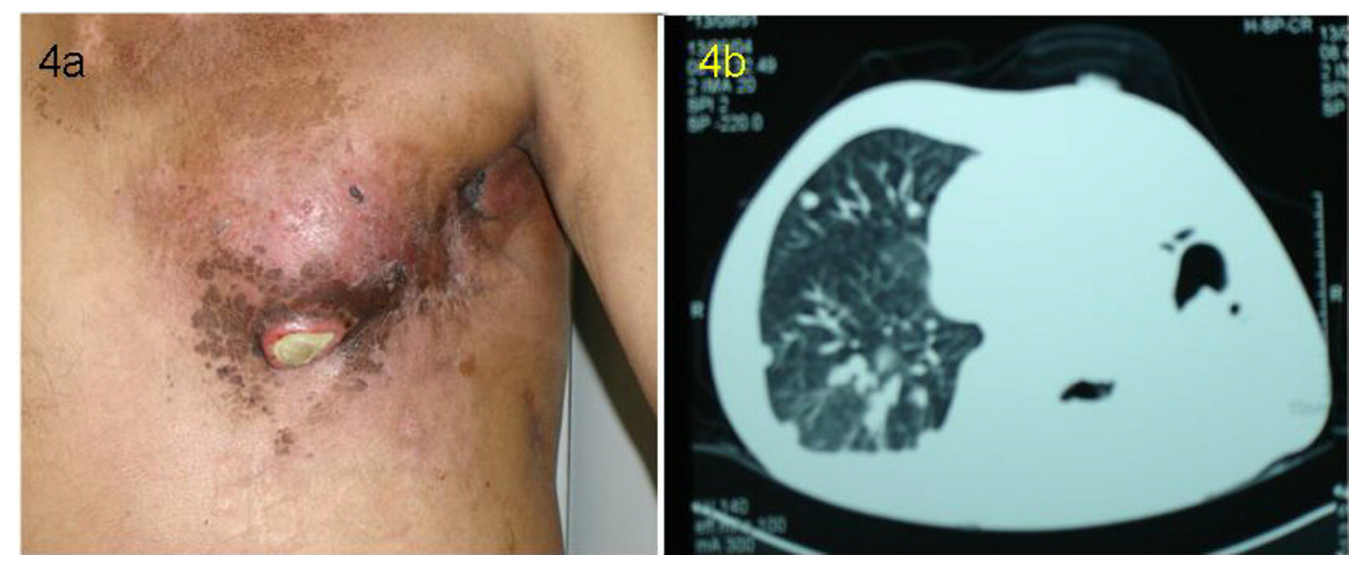
Figure 4 Disease in the chest wall (4a) and lung (4b) after radiation and concurrent chemotherapy. There was only minor response in the chest wall disease and essentially no change in the lung.

(Tegafur-Uracil) to the chest followed by systemic UFT as a single agent for 3 months. Post-treatment, there was no change in the pulmonary disease and there was minor response of chest-wall and axillary disease (Figure 4a and 4b).