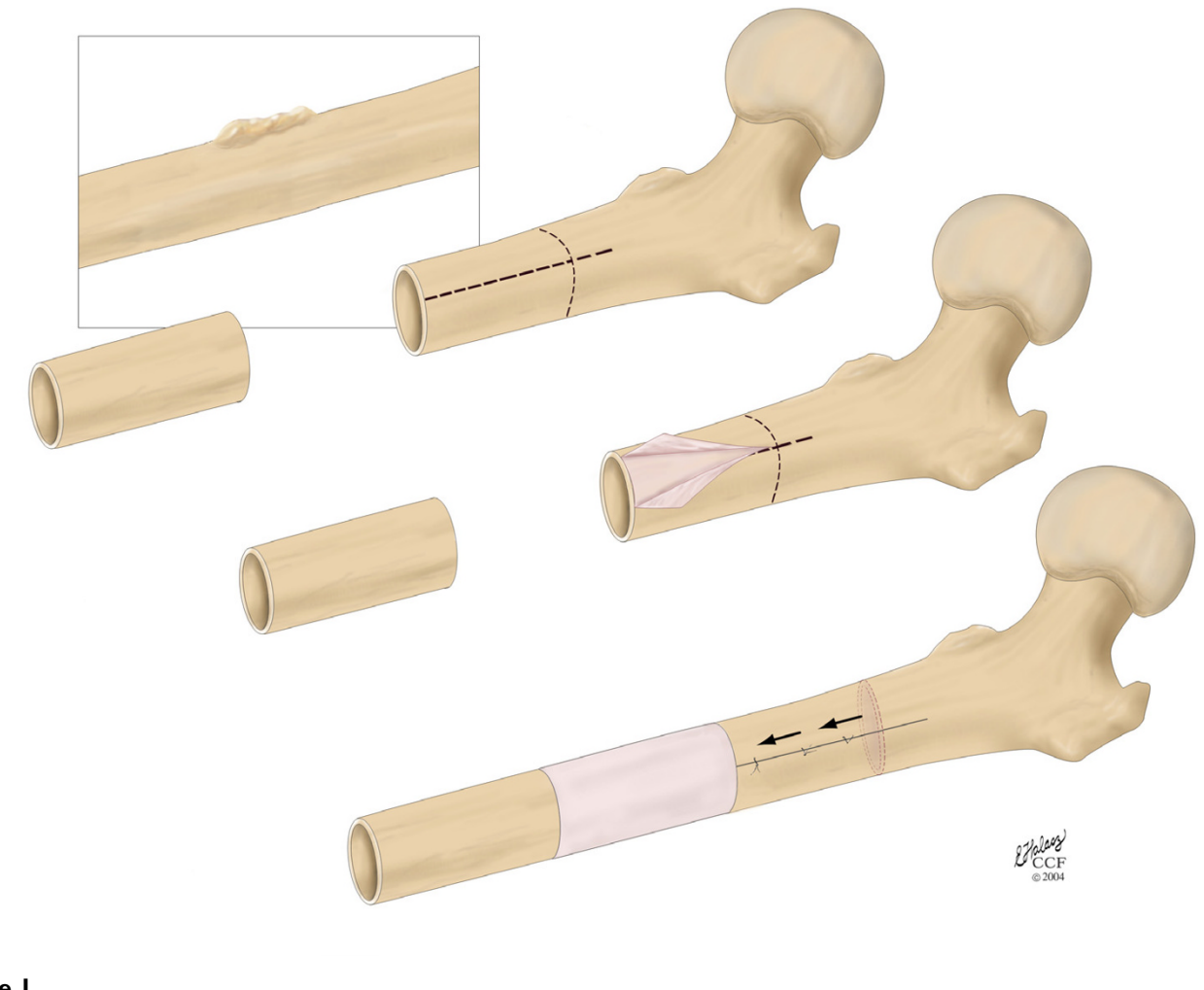
Figure I Schematic diagram showing the concept for the new surgical procedure.

corresponding author conceived of the idea to exploit the potential of the healthy periosteum by moving the defect site from a pathological zone to a healthy one and then providing sufficient mechanical stability to let bone's endogenous healing capacity regenerate functional tissue within the new defect zone.