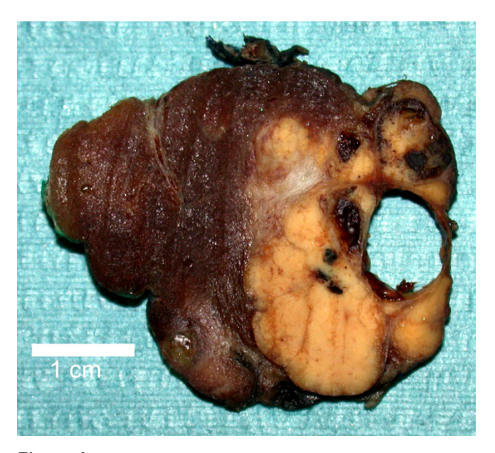
Figure I Gross appearance of parathyroid tumour and thyroid lobe.

(2%) were diagnosed with distant metastasis to lung or bone at their initial presentation.