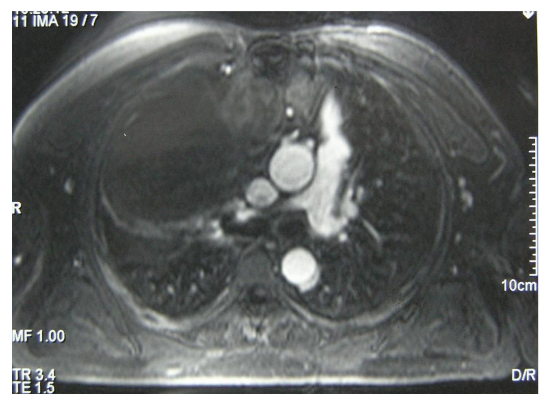
Figure 2 MRI transverse scan showing mass extension and anatomical relationship between the tumour and the tree grafts at level of ascending aorta.